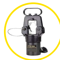
Split Hydraulic Crimping