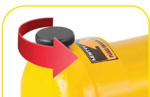
Secure Bleed Nut