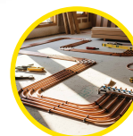
Floor Heating Installation