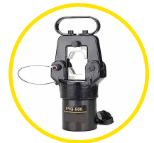
Split Hydraulic Clamp